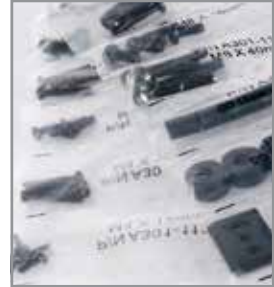
Mounting Hardware Complete set of mounting hardware, labeled for ease of use and ready to go.