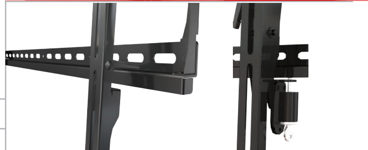
Kickstand for easy cord installation