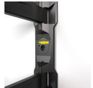
3 Attachment points and a built in level