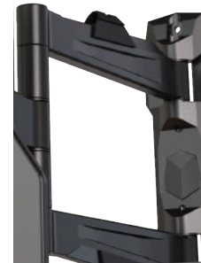
Decorative covers hide screw heads